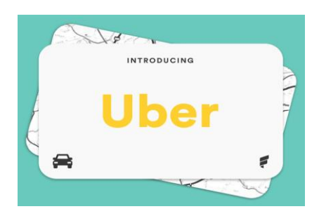
Welcome Uber to Fold!

Hopefully we will see a lot more use cases like the one below in 2019 and the years to come.